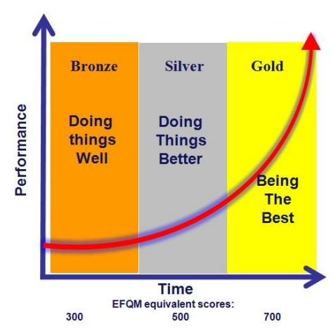
Figure 1: Schematic of the Bronze-Silver-Gold levels

The 'audit cycle' gives rise to a number of simple actions which are designed to develop the mindset of Continuous Improvement by focusing on the five Bronze Qualifying Requirements, namely: